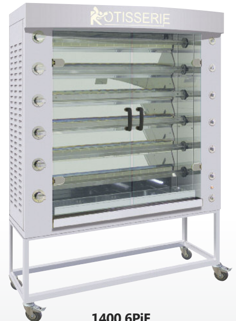
1400.6PIE Stainless steel finish