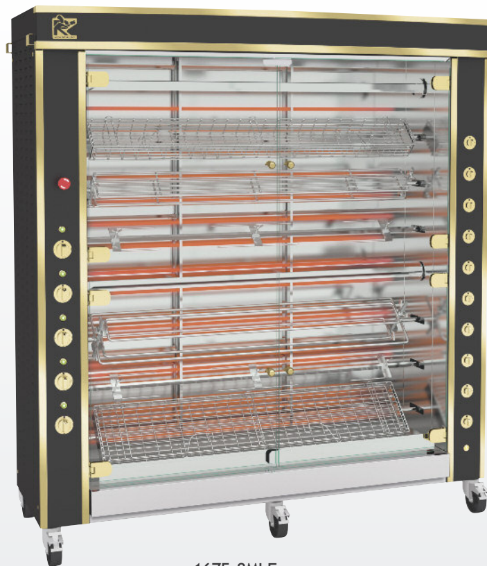
1675.8MLE Black enamel and brass