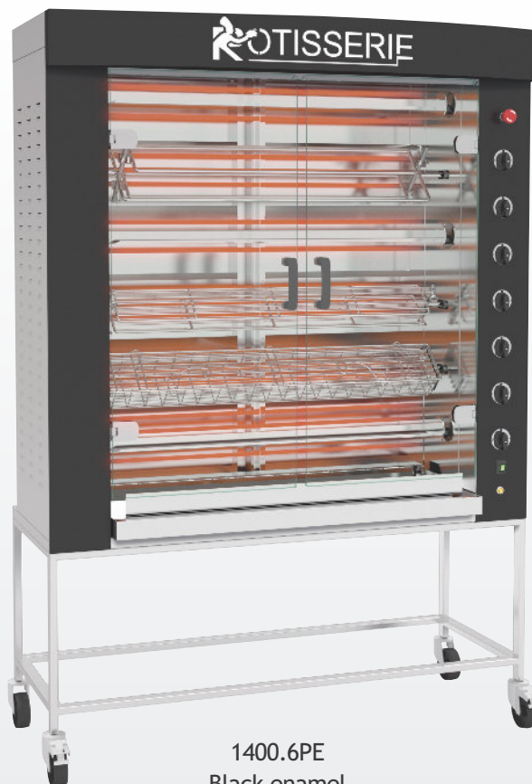
1400.6PE Black enamel