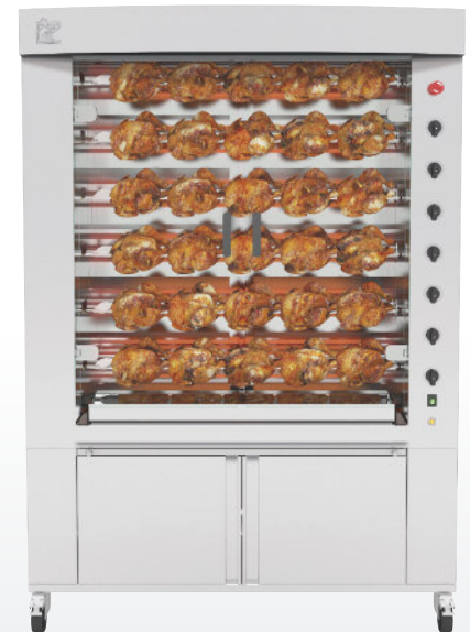
1400.6PiE Stainless steel