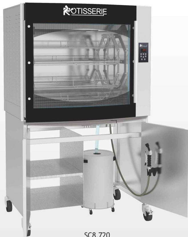
SC8.720 (optional stand)